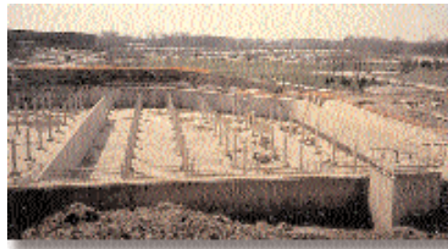
Figure 1: The Hap Cremeans water treatment plant in Columbus, OH used 30% slag cement with Type II portland cement to achieve sulfate resistance.

Waterborne sulfates react with hydration products of the tri-calcium aluminate